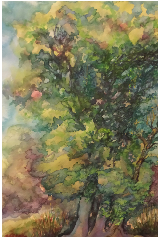
Family Portrait , 2016, watercolor, 19 x 13 inches, Collection of the Artist

During my working years I did not have the time or energy to paint. After retirement, I decided to get back into art and focus on landscape painting – nature has a story to tell regardless of the season. The color of trees constantly changes over the course of the year, transitioning with the new greens of spring or the chilling blue colds of winter. I appreciate the cloud shapes and colors that set the mood of a work. I love capturing the peaceful moments as dusk approaches with nature’s last