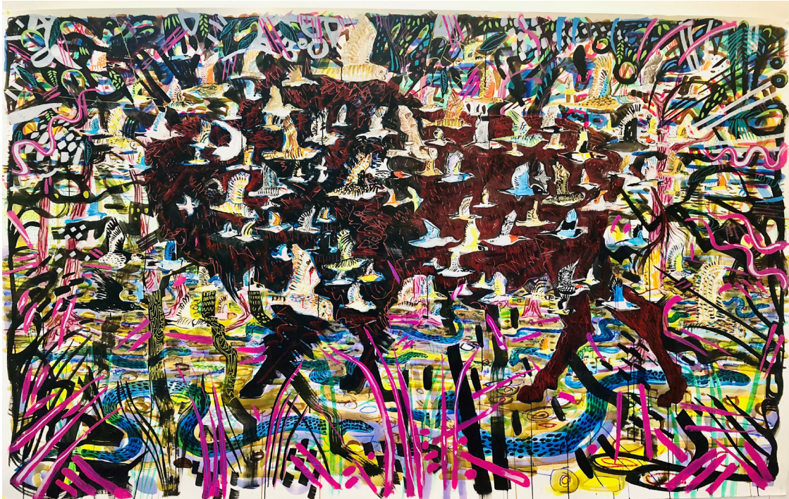
Jules Buck Jones, Wrong Wind , 2018, ink, watercolor, and pastel on paper, 72 x 114 inches, Loan Courtesy of the Artist

On View March 16 through June 2, 2019 Opening Reception Friday, March 22 | 6:00 - 8:00 p.m. Featured Speaker: Artist Jules Buck Jones