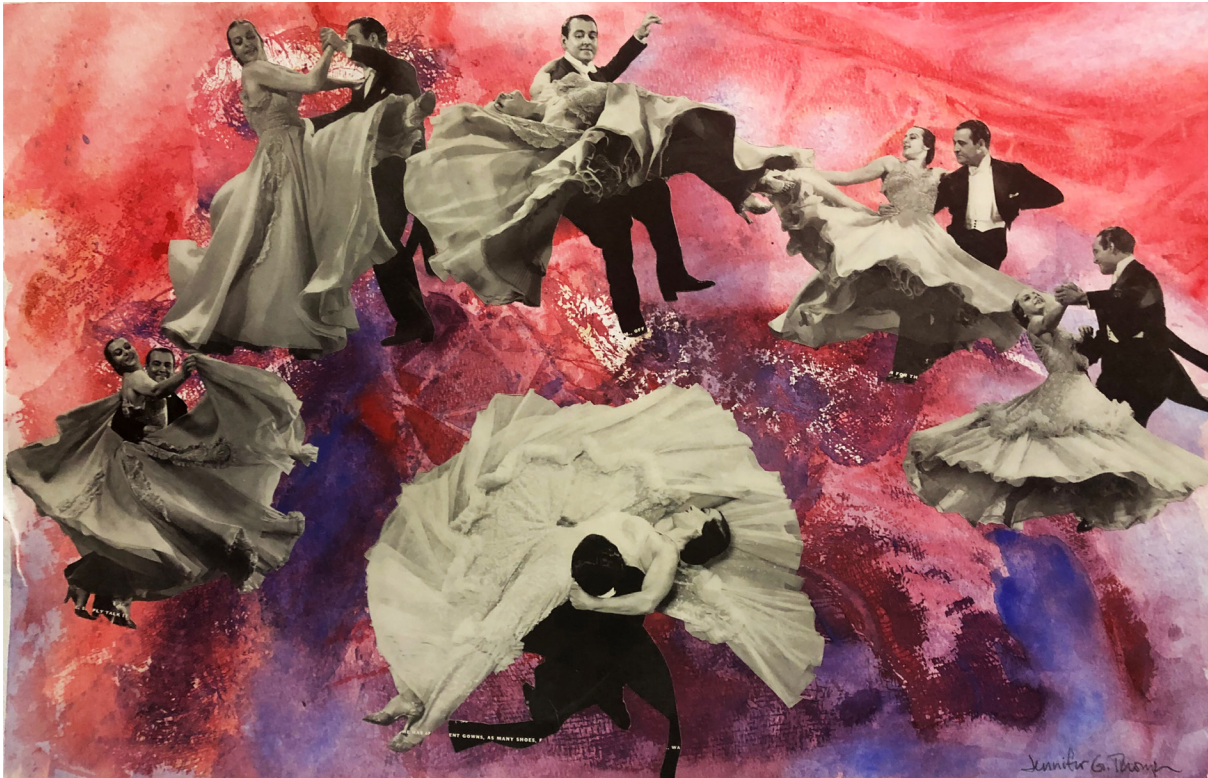
Jennifer G. Thompson, Color Field Dancing , 2016, vintage magazine collage and watercolor on paper, 13.25 x 20 inches

Artist's Reception: Saturday, July 13, 2-4 p.m.