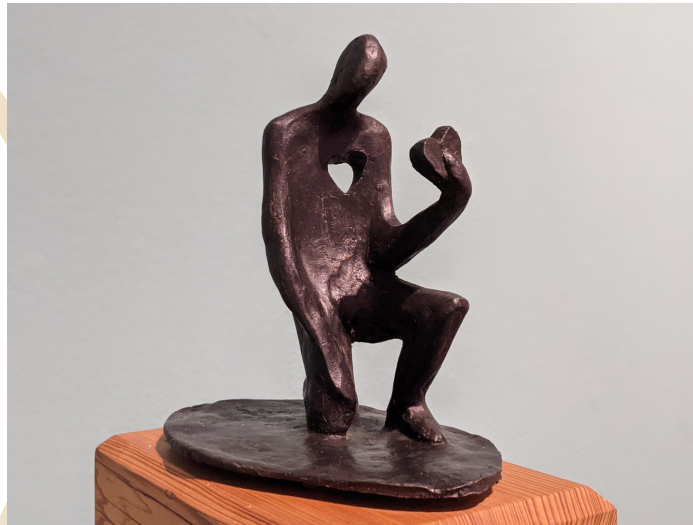
David Cargill, Man with Heart , n.d., cast bronze, image courtesy of AMSET

The Lighter Side presents the boundless imagination of the artist, who manipulates different materials to create sculptures that seem to move, twist and breathe. Focusing on themes of love, play and whimsy, this exhibition highlights small and large-scale sculptures from the permanent collection of the Art Museum of Southeast Texas, as well as borrowed