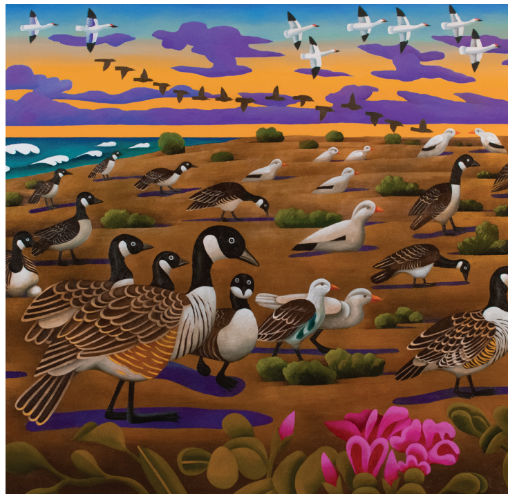
Billy Hassell, Canadian Geese and Snow Geese, Texas Shore, 2022, oil on canvas, 60" x 72"

Join AMSET and the local Magnolia Garden Club for their biannual competition and flower display on March 29th and 30th. The