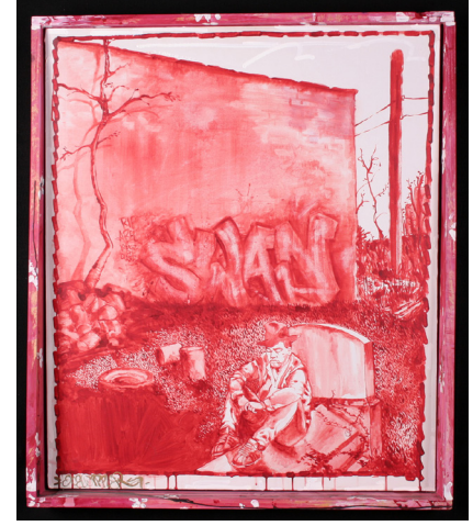
Joseph Wippler, Adios Abel , 1987, acrylic wash on canvas with hand-painted frame, PC 1988.01, museum

olors play such an important role in our world. For example, when we think about seasons, they are often symbolized by colors. Bright green is synonymous with the new growth of spring, while gold and brown evoke feelings of autumn. When we think about clothing and colors that people wear, it can often reveal an area of the country that they live in. Think about how people in New York City typically dress. They wear more somber hues versus people in Hawaii or Florida who like the bright, tropical colors. Also consider how color plays a role in motion. What does red mean when we are driving? How about green and yellow?