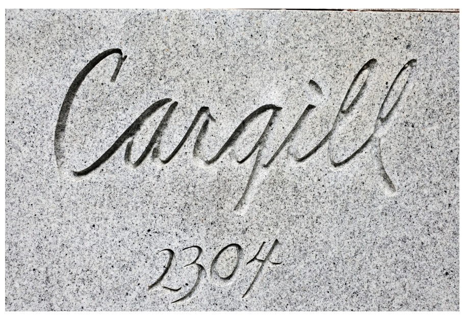
Detail image of cornerstone at sculptor David Cargill's house. Contains signature of sculptor and address of house.