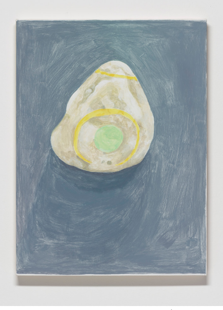
Francesca Fuchs, Painted Rock (yellow/green) , 2021, acrylic on canvas, 25" x 18 3/4", image courtesy of the artist

This event is free and open to the public. For more information, visit www.amset.org or call (409) 832-3432.