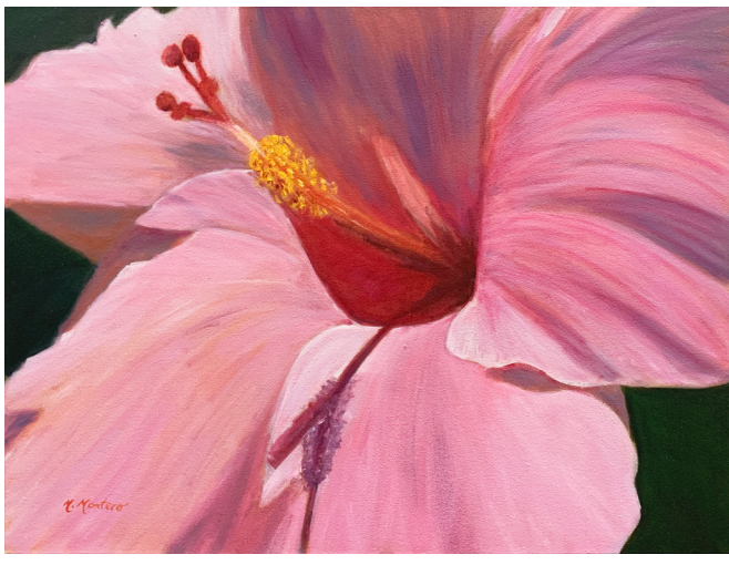
Melody Montero-Ortiz, Blossom I, 2010, oil on canvas, 18 X 24

an artist is to be able to communicate visually in such a way as to stimulate the viewer's imagination to see not only with their eyes but also with their