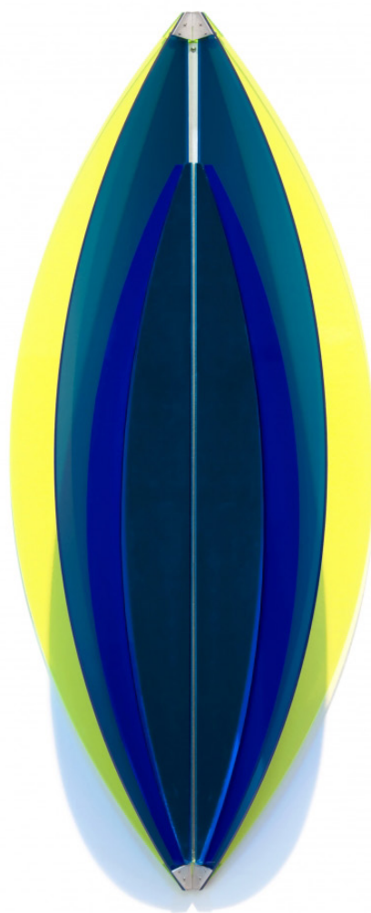
Claire Ankenman, Striped Flare #3 , 2020, stainless steel and plexiglass, image courtesy of Moody Gallery

Free Family Arts Day: Saturday, October 22, 10 a.m. - 2 p.m.