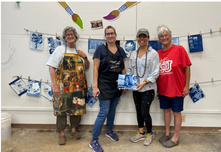
L - R