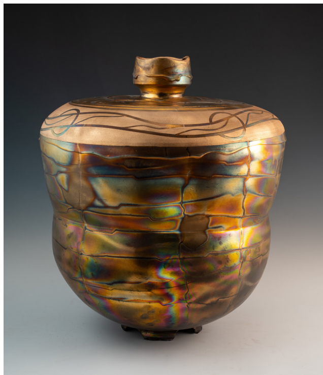
James Watkins, Bottle Form , stoneware wrapped in bailing wire, gold luster, fumed with stannous chloride, etched with glass etching solution, image courtesy of the artist.

To find out more about how National Endowment for the Arts grants impact individuals and communities, visit www.arts.gov .