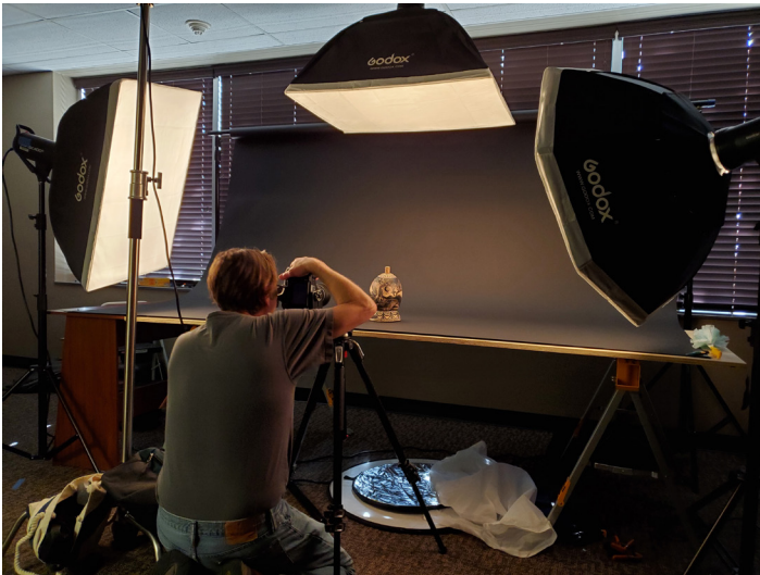
John Fulbright photographs a Mexican Folk Art object for the first IMLS grant project.

AMSET is proud to announce that it has completed a two-year, $46,000 Institute of Museum and Library Studies (IMLS) Inspire grant, resulting in over 4,000 professional photographs of the 460 objects in the John Gaston Fairey Collection of Mexican Folk Art. The very best of these photographs have been used to create a collections database website, which visitors can access for free. The database includes photographs and information about artworks in the Fairey Collection. The database can be accessed through AMSET's website on the Collections page, and fulfills the need to spotlight the permanent collection to the public. Now, anyone can see artworks that are typically kept in storage unless on display for a special exhibition. These photographs will also be used for future educational and promotional materials, including promoting upcoming exhibitions and a future bi-lingual catalog. The museum will use the rest of the photographs for collections management purposes, allowing museum staff to note changes in conditions to the artworks over time.