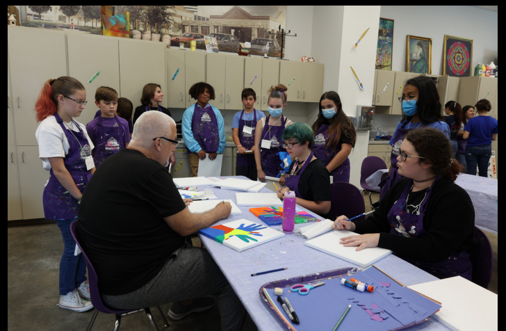
Teens attend Teen Week ArtVentures Camp

have many exciting courses to choose from including clay, textiles, mixed media, printmaking and even kinetic art.