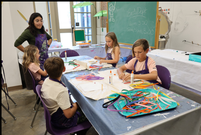
Children attend ArtVentures Camp

will have the opportunity to sample clay, paint and mixed media through simplified projects formatted for their age group. These classes will be augmented with art-related story times and outdoor activities.