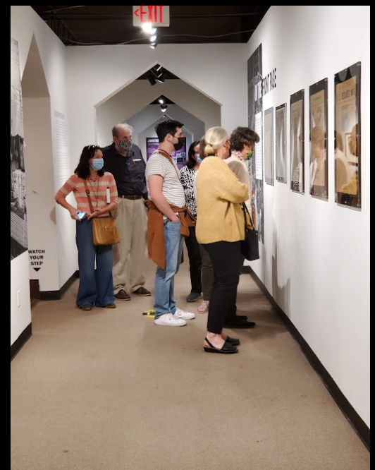
Collectors Club members during a tour of the Houston Printing Museum