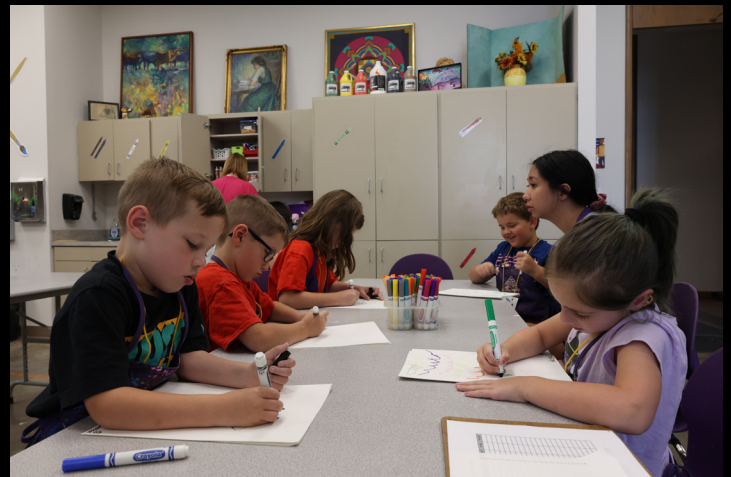
Children attend Young ArtVentures Camp