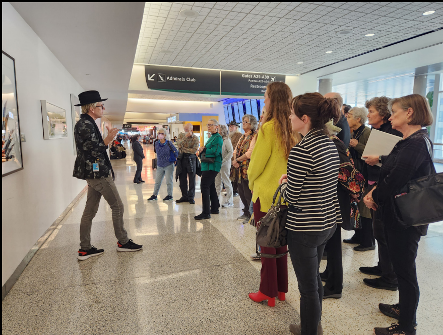
Collectors Club members attending an exclusive tour of the IAH's airport's art collection in February 2023.