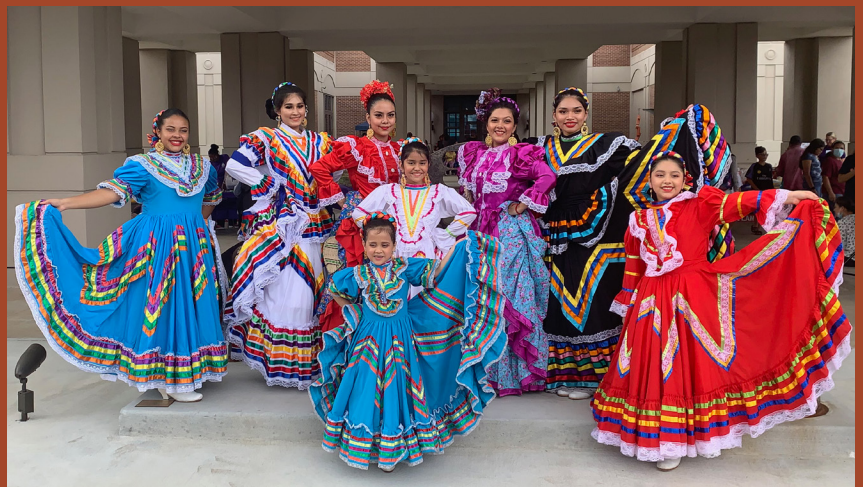
Mexican Heritage Society Folk Dancers