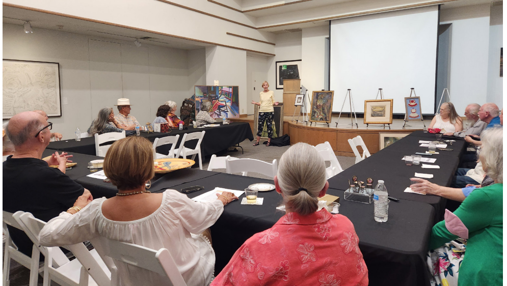
Collector's Club members during the Collector's Club Show n' Tell

Complimentary light refreshments included salmon bites with tarragon sauce and mixed berry cobbler with ice cream, as well as cookies, chips and dips, and an assortment of wine, sodas, and sparkling waters to drink. Overall, it was another great Show n' Tell! We can't wait for next year's event!