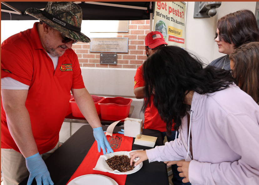
Bill Clark Pest Control handing out fried crickets