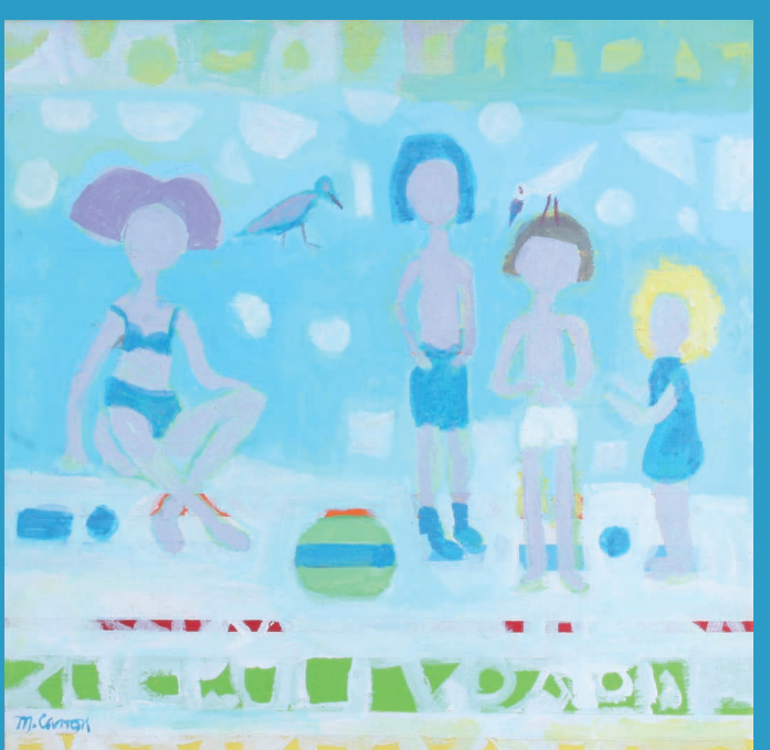
Maudee Carron, In the Cold Blue Translucent Air, n.d., acrylic on board, PC 2002.06, Gift of Mary Anne Martínez and Willa W. Hunter

The Art Museum of Southeast Texas (AMSET) presents a return to the annual summer tradition of exhibiting works from its permanent collection with the exhibition, Summer Days: selections from the permanent collection . AMSET's permanent collection is always growing and currently includes over 1,700 objects representing over 430 artists. This show is comprised of paintings, drawings, sculptures and folk art depicting how people partake