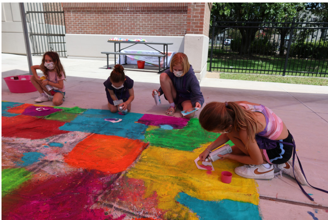
Children attend ArtVentures Camp.