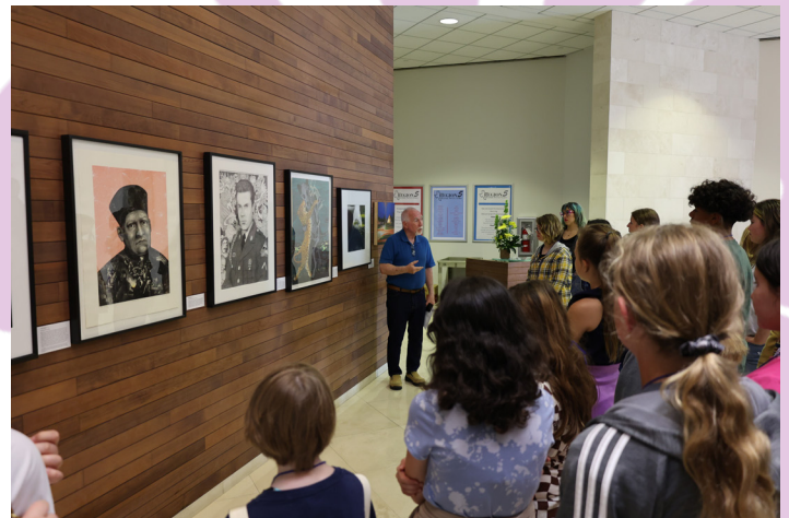
Teens attend Teen Week ArtVentures Camp.

have many exciting courses to choose from including clay, woodwork, mixed media, watercolor, and the art of melting. Campers will experiment with acrylic pouring, collaborative murals and much more.