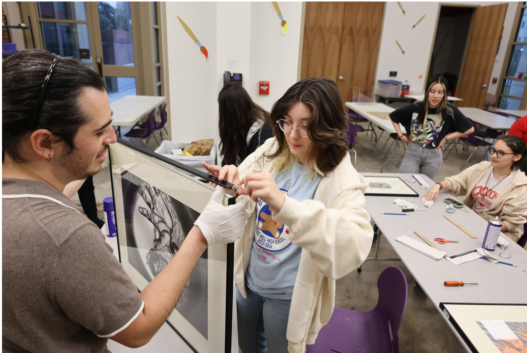
2024 Protégé Workshop with AMSET Curatorial Department