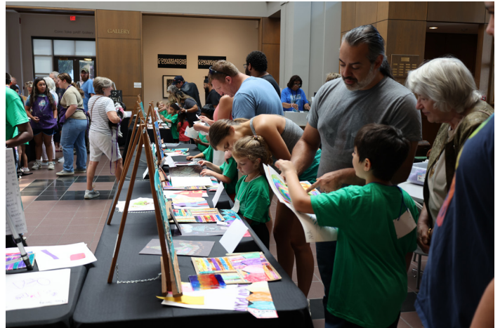
Children attend Young ArtVentures Camp.

will have the opportunity to sample clay, paint and mixed media through simplified projects formatted for their age group. These classes will be augmented with art-related story times and outdoor activities.