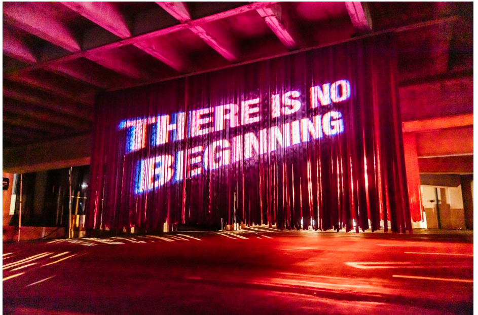
Alicia Eggert, The Future Comes from Behind Our Backs , 2020-24, image courtesy of the artist and Hignite Projects

All the Light You See will focus on light as a medium and include two commissioned site-specific installations, as well as several neon signs, lenticular prints and an outdoor installation. The installation The Future Comes from Behind our Backs will be re-created so that people can walk through the silk ribbon screens in the main galleries. This work was originally exhibited in a Dallas parking garage during the pandemic. A second