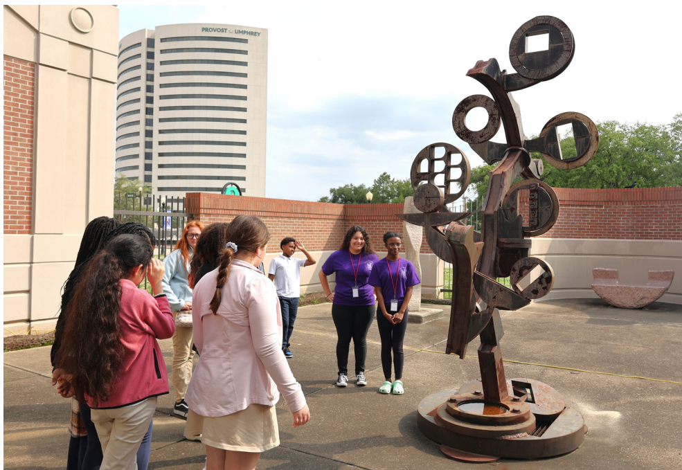
OJDs tour their fellow students in the sculpture garden