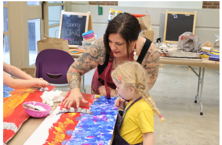
Children attend Young ArtVentures Camp.