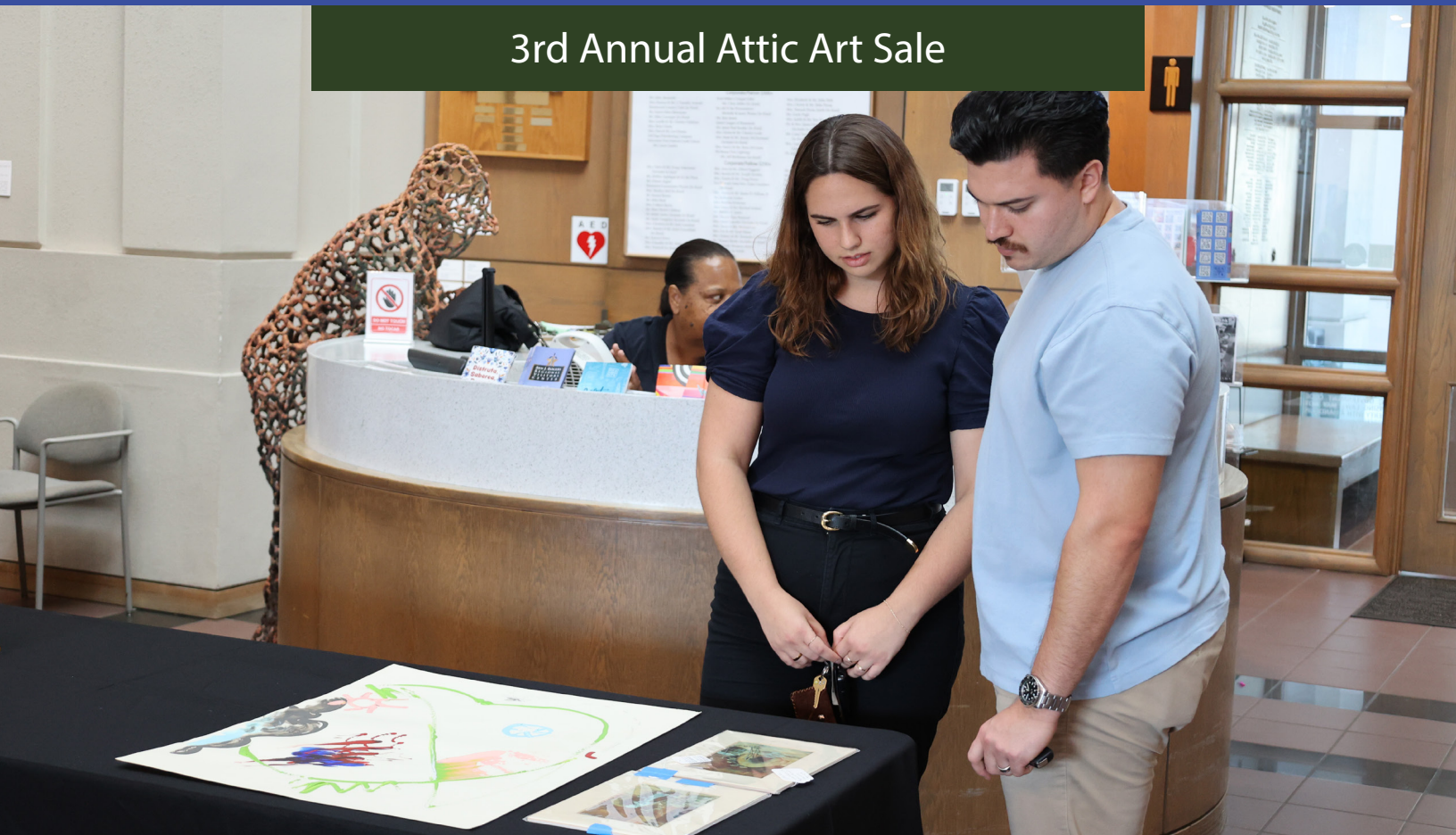
Visitors browse at the 2024 Attic Art Sale