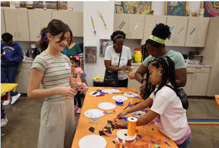
Volunteers assist kids at the May Family Arts Day