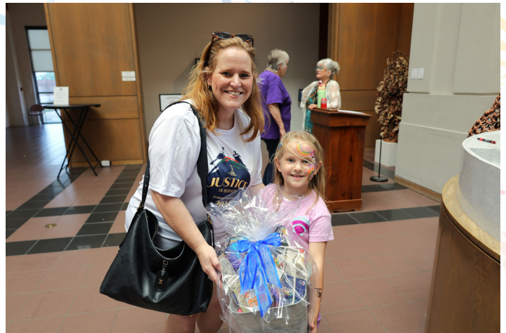
Raffle basket winners at the May Family Arts Day

There will be two live performances from Gator Country at 11:00 a.m. and 12:30 p.m. and 3 raffle drawings throughout the day for a chance to win a backpack full of art and school supplies to kick off the 2024 – 2025 school year. The galleries will be open for viewing to gain an understanding of the art projects and to feed your appetite for art! This event is FREE and open to the public. See you soon!