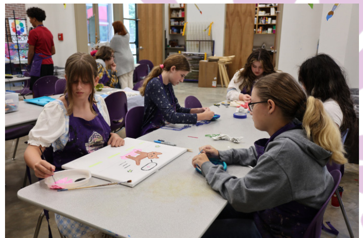
Teens attending Teen Week ArtVentures Camp, 2023.

ArtVentures had many exciting courses to choose from including clay, woodwork, mixed media, watercolor, and the art of melting. Campers experimented with acrylic pouring, collaborative murals and much more.