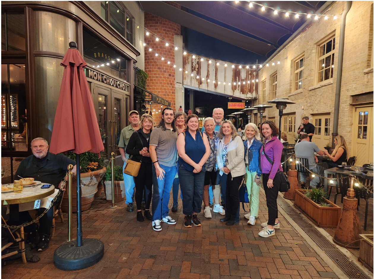
Collector's Club members attending dinner at Mon Chou Chou, Pearl Brewery District, San Antonio

The Collector's Club went to Marfa April 23 through April 28. Two Chrysler mini-vans full of 9 AMSETTERS embarked on this adventure stopping in San Antonio on the way there and on the way back. Featured highlights included a tour of Hotel Emma in San Antonio, tours of the La Mansana/The Block (Judd Foundation), Donald Judd's studio in downtown Marfa, a studio visit with Julie Speed, a Star Party at McDonald Observatory and a visit to the McNay Art Museum in San Antonio. Plenty of good food and laughs were shared by all.