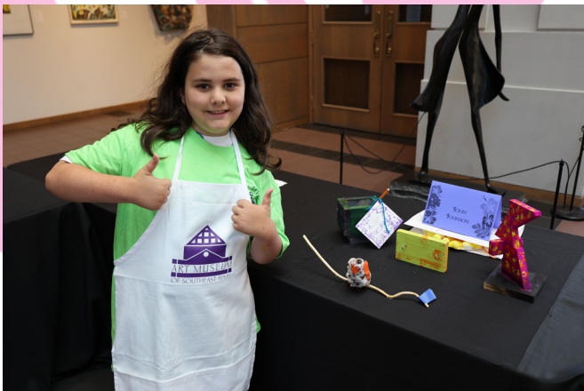
Children attend ArtVentures Camp.

Young ArtVentures sampled clay, paint and mixed media through simplified projects formatted for their age group. These classes were augmented with art-related story times and outdoor activities.