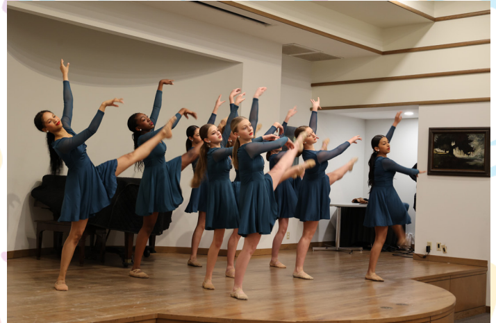
iRule Dance Studio performing at the May Family Arts Day

D on't Mess with Texas, Mess with Art! Bring your family and friends to AMSET's Free Family Arts Day, August 10th, from 10:00 a.m. until 2:00 p.m. Families will create artworks inspired by our summer exhibition, Dreams, Screams and Fantastical Things and Mundos Pequeños: Miniatures from the John Gaston Fairey Collection of Mexican Folk Art while also recycling to clean our community and planet.