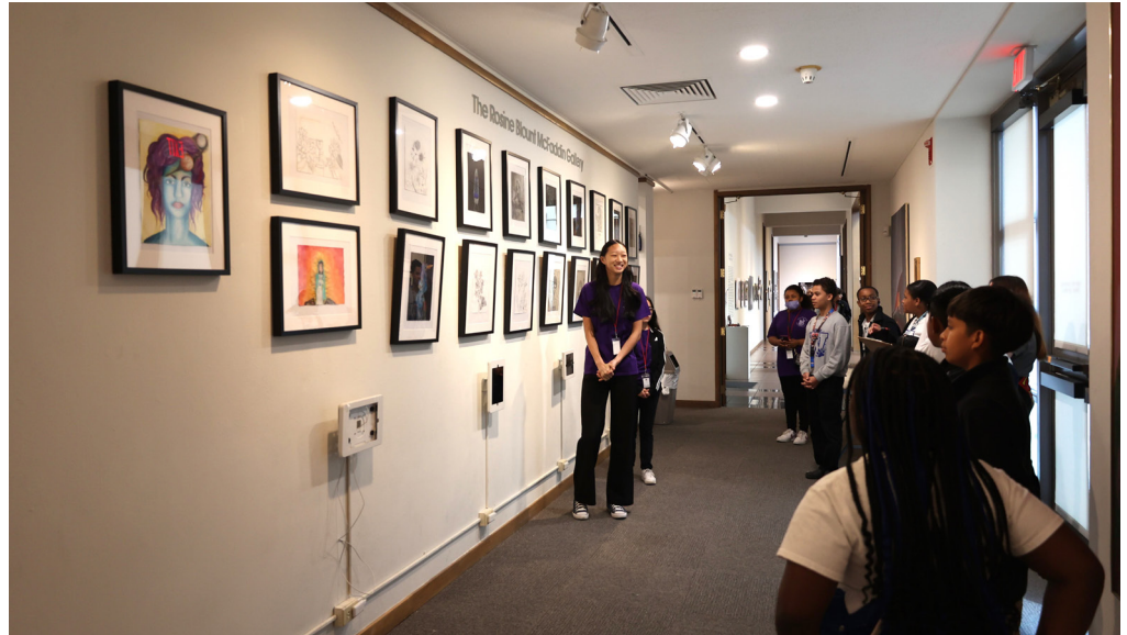
OJDs tour their fellow students in C-Space